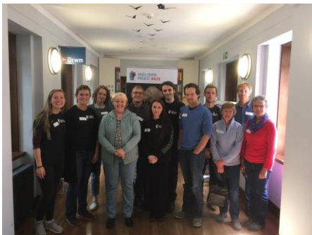
Citizen science history group at the workshop in Aberystwyth.

10 citizen science volunteers were recruited to help unlock the history of Angelsharks through searching archives, libraries and museums. To launch this part of the project a workshop was held at the National Library of Wales.